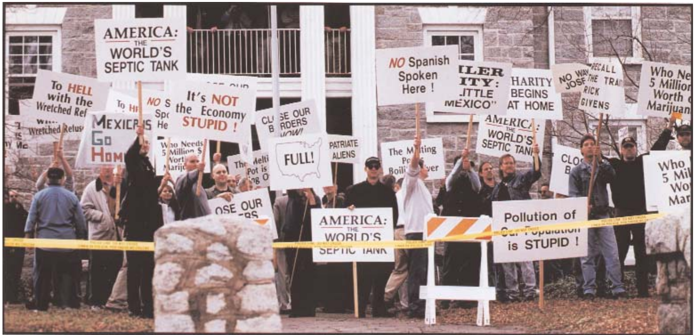
Siler City Rally, 2000

Key Question: How does the arrival of immigrants to a community divided by race complicate notions of race, identity, and class in the United States?